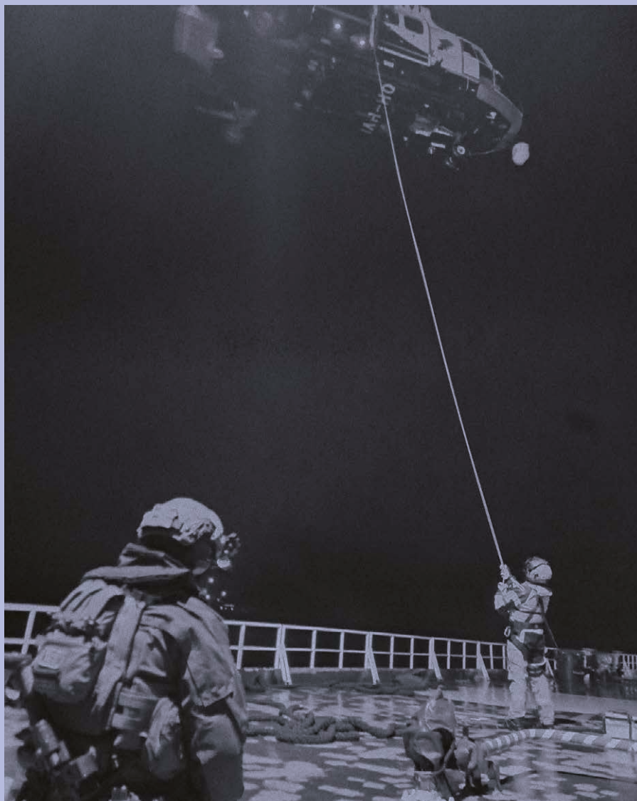
[Image] The Finnish Police Special Intervention Unit Karhu and the Gulf of Finland Coast Guard Special Intervention Unit board the Russian shadow fleet tanker Eagle S on Christmas Day 2024. The tanker is suspected of cutting the Estlink 2 undersea power cable, which connects Finland and Estonia.